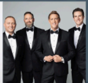
Ernie Haase & Signature Sound