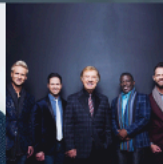
Gaither Vocal Band