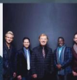
Gaither Vocal Band