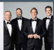
Ernie Haase & Signature Sound