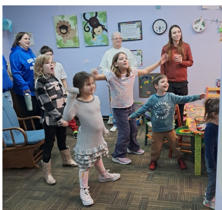
Pictured: counting down to the New Year!

Along with the Advent/Christmas Offering letter you should have received a pledge card for 2026. You are encouraged to prayerfully consider your commitment to Trinity Ralston and fill out and return these cards so Leadership Team has a more accurate view of the coming year. As always, your commitment of your time, talents, and gifts during 2025 and the preceding years has been exceptional. Thank you for supporting Trinity Ralston and its ministries!