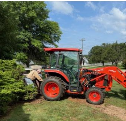
Photo of shrub removal on Saturday, July 26th. We do plan to plant fresh shrubs as soon as we receive a plan from the landscaper.

This week the masonry around the church restored. The deteriorating mortar was ground out and replaced. The masons used different color mortar to match the existing color as close as possible. The original church was dedicated in 1942. This repointing restored to areas most in need in hopes that it will last for many years.