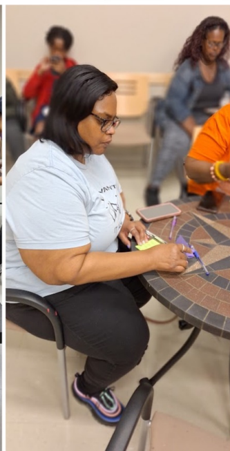
Writing an encouraging note to one of the recipients of the goodie bag