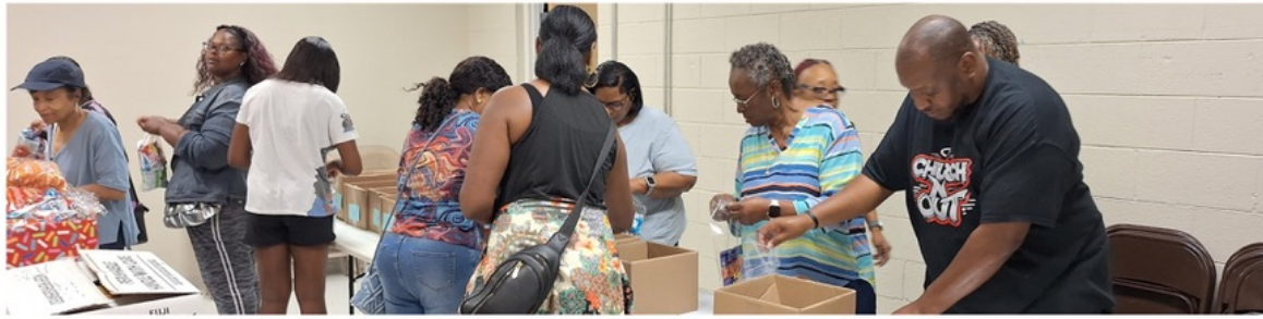
Packing goodie bags for the children