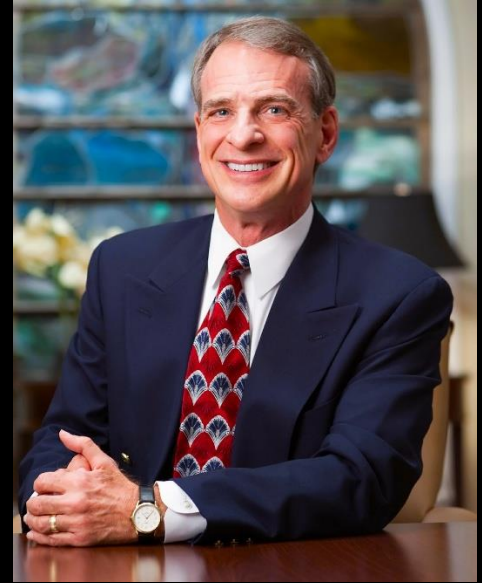
William Lane Craig

“A hard teaching, no doubt; but the logic of the New Testament is simple and compelling: the universality of sin and the uniqueness Christ's expiatory sacrifice entail that there is no salvation apart from Christ.”