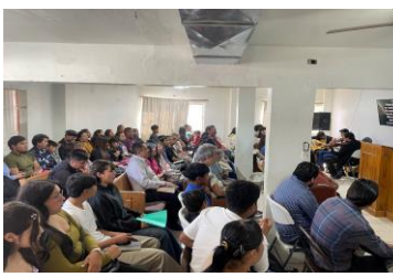
Sunday service Fall, 2025