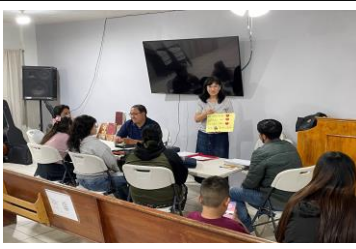
Training class for teachers