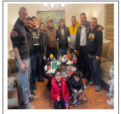
Men's Bible Study