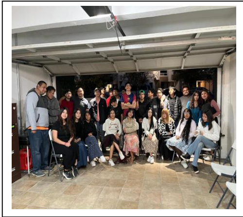
Teen Bible event at our house