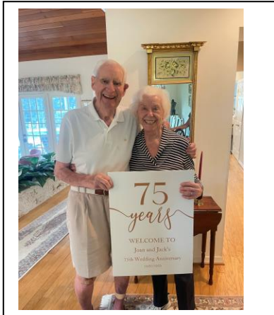
Our parents 75 th anniversary