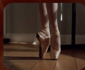
Ballet and Embodied Faith 10/8