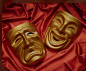
Musical Theater and Spirituality 10/1