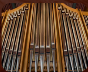
Pipe Dreams: Hidden Images in Music 9/24