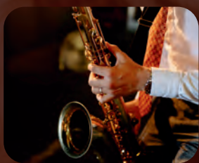
Jazz and the Spirit of Improvisation 9/17

Join us for a 4-week Wednesday evening series this fall exploring creative expression through music, dance, storytelling, and faith formation. Each week offers a unique presentation, designed to be engaging and accessible for all ages: