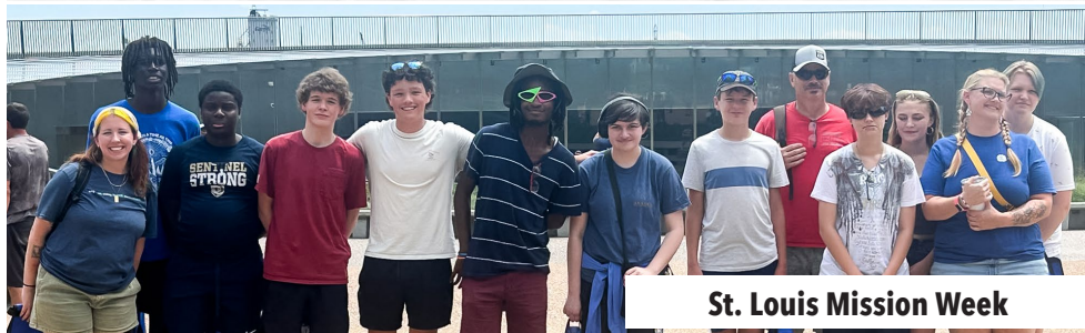
St. Louis Mission Week