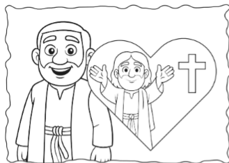
Philip was friends with Jesus, and he loved God.