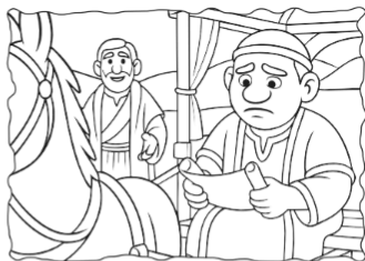
The angel told Philip to walk down the road and God told him to go to the chariot.