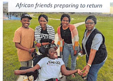
African friends preparing to return