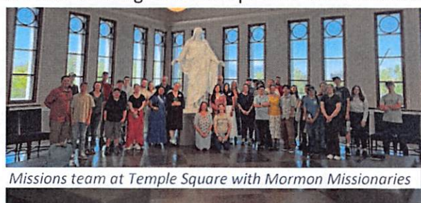
Missions team at Temple Square with Mormon Missionaries

and Idaho. Together, they learned how to better engage Mormons with the gospel, canvassed two communities in preparation for a future church plant, helped serve local churches, volunteered at a Christian radio station, invited people door to door, and even interacted with Mormon Missionaries and BYU professors. It was a powerful week of ministry, and we're grateful for how this team helped advance the gospel in Utah.