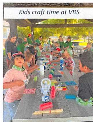
Kids craft time at VBS

That same month, we held our annual mission camp. We had 35 to 40 participants representing four churches from North Carolina, Texas, Colorado,