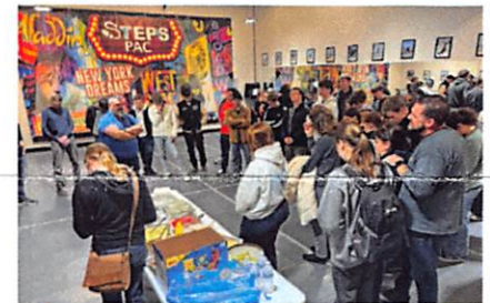
A missions team during Missions Camp

Looking ahead, if your church is looking for a great missions trip this summer consider a trip to Utah this June. Check out faithelevated.com for more information. We love hosting groups and providing meaningful mission trip experience. We typically