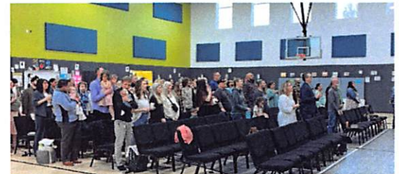
Cornerstone Bible Church