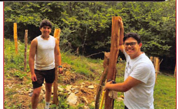
Two young men working at Aierdi

At the Christian Workers' Retreat in August, we often got together to sing hymns and share testimonies.