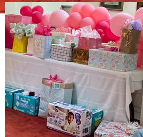
Women from First Baptist Church and Iglesia Biblica Bautista joined together recently to celebrate a new mom and her beautiful baby. We love these opportunities to serve and fellowship together!