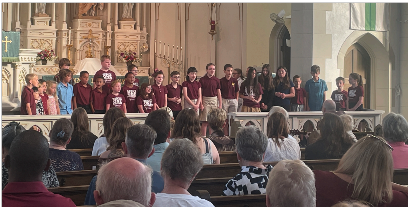
Concordia students from Kindergarten through Grade 5 sing at Trinity on Sunday, Sept. 14.