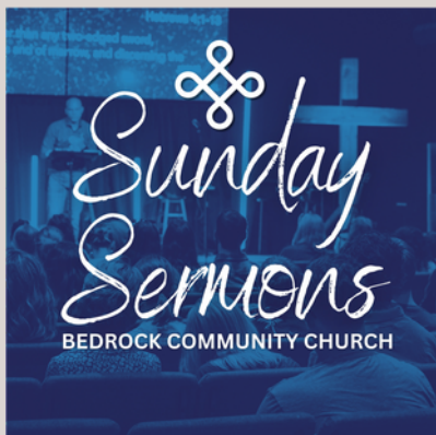
Sunday Morning Sermons

Looking for encouragement throughout your week? Check out our Sunday Sermons podcast to catch up on past sermons. Our Foundation podcast is aimed to give stories that will strengthen your faith. And don't miss our curated Spotify playlist “Take Sunday With You” filled with worship songs to keep your heart centered on Christ wherever you go. Subscribe, listen, and worship with us anytime!