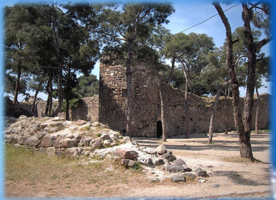
The fortress of Kadifekal was built by Lysimachus in ca. 300 BC.