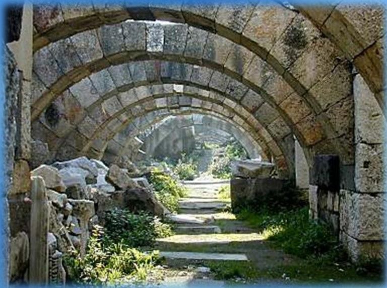
Agora First Level Arches