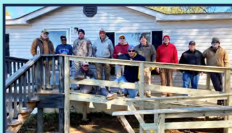
All year long, the Men in Mission minister to our community with wheelchair ramps.