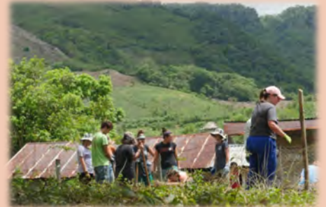
Photo from 2023 Student trip