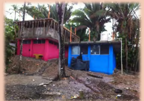
Photo from Cuatro Cayos village

God, we give You honor and praise for how You hold all things together and for the grace and mercy You give us each day. We thank You for how You call each of us to Your purpose. Today, we give special thanks for calling this group of willing missionaries. This is not just any trip because You are calling them to something bigger this week: to be a witness to You, O God, in the lives of those they will serve.