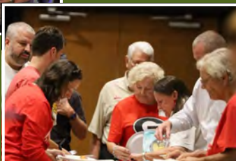
Tailgating food is the bomb!