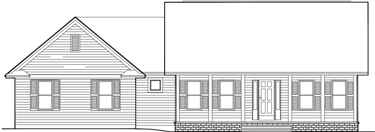
○ FRONT ELEVATION

©2001 DAVID R. MANGO DESIGN GROUP, INC. ALL RIGHTS RESERVED