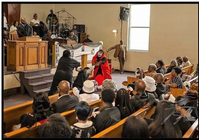
Bethel Baptist praise dancers performed.

Dinner was then served at the Family Life Center.