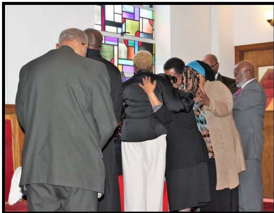
Left: EBC Pastoral leadership offer prayers to Min. May.