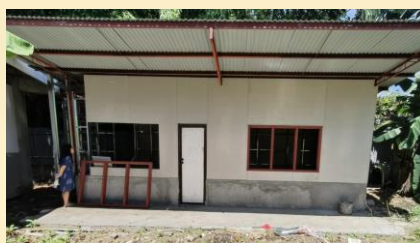
A view from outside of the new dorm, with Maricris standing beside to give it context.