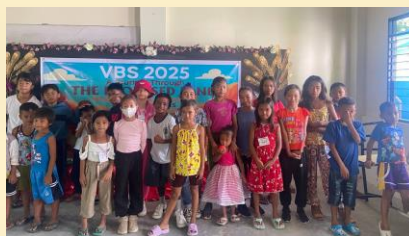
These children attended the VBS activities held during the last week of June, at our campus in Cebu.