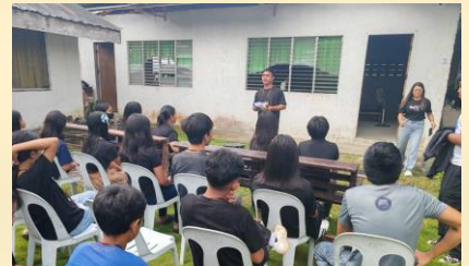
VBS activities for teens at Pigdaulon on the island of Mindanao. And we're hoping many of these will become future students at LCC.