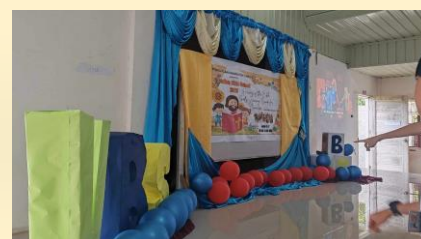
The beautiful stage which was built for the VBS in Pigdaulon Church of Christ - theme: "Heroes of the Bible: God's Training Camp for Courage."