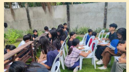
Many of the materials used (handwork, supplies, etc.) were donated by YOU, our generous supporters.