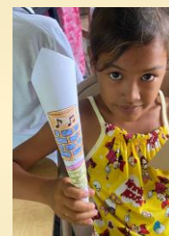
Left to right: These six pictures are all of various times & activities in our many VBS weeks held, both at the two campuses and the nearby churches. VBS activities are always a highlight in the communities, as children love these fun weeks. It is amazing what a lack of distractions can do toward making a VBS week a successful time!! We thank you for your generous support in this work.