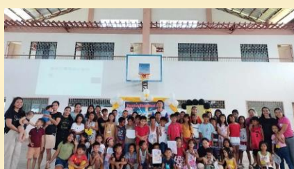
One of the most successful of all the VBS weeks was held at LCC- Tacloban campus, the last week of May. More than 65 kids attended