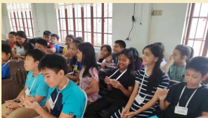
Many of our current students spend their summers interning at various churches of Christ, doing such things as hosting VBS, etc.