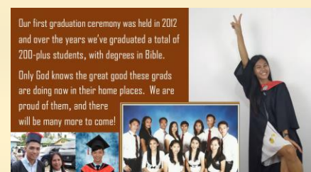
More than 200 graduates of the Bible college now, with (God willing) many more to come over the next few years & decades!!! Thank you, dear supporters, for making it happen!!