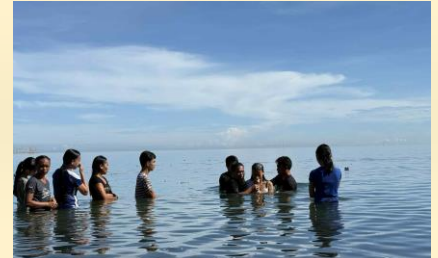
The line begins for these seven young new converts for their baptisms.