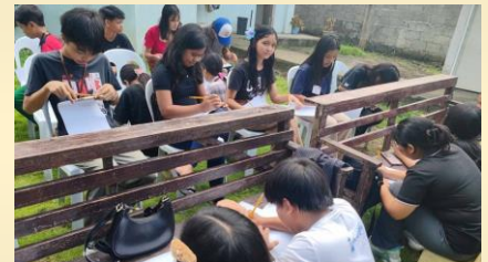
Even if the venue is sometimes outdoors in the VBS, it's usually fine for all Filipino kids.