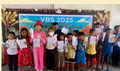
"A Journey Through The Promised Land" was the theme for the week-long VBS at the LCC-Cebu campus.