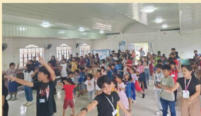
VBS is very big in the Philippines. Filipino children don't have near the distractions that we have in America.