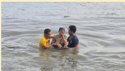
"Risen to walk in a new life" after obeying Christ in baptism.