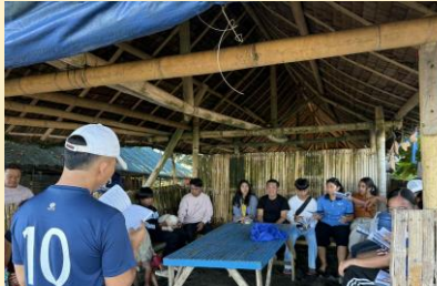
Seven young people near our Tacloban campus here, about to obey the Gospel and be baptized in the Pacific Ocean.