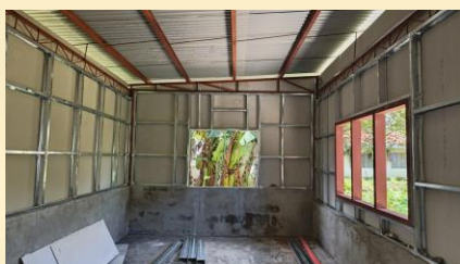
Inside "nearly-completed" new boy's dorm at the LCC-Cebu campus. We should be able to put about eight to ten boys in this dorm.