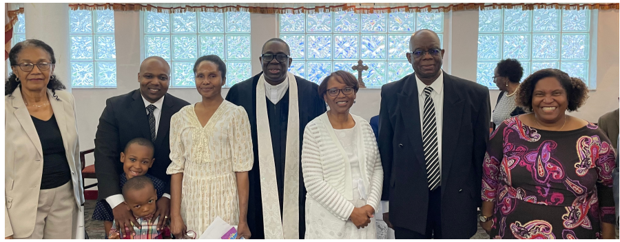
Welcome New Members into the Church's Mission.