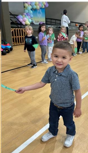
... Palm Parade ...