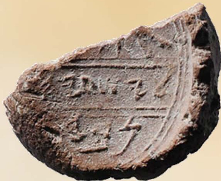
The bulla (clay seal impression) of Prophet Isaiah.