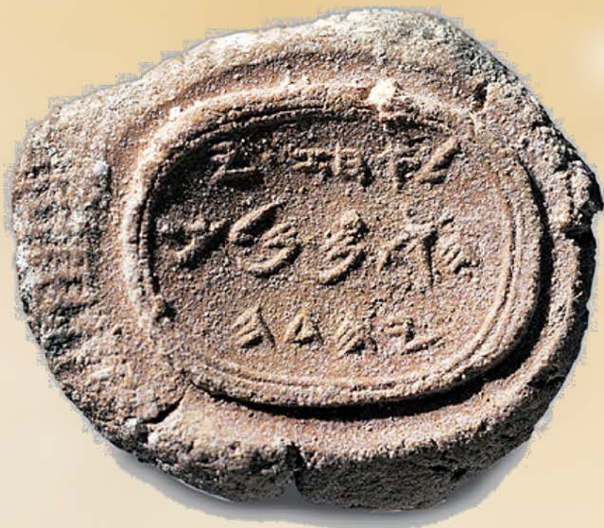
The bulla (clay seal impression) of King Ahaz.