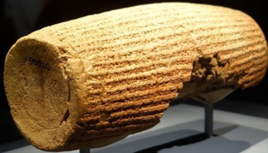
King Cyrus (538 BC / Persia)