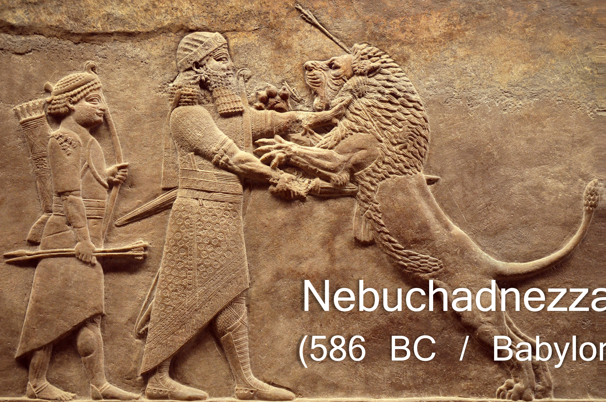
Nebuchadnezzar (586 BC / Babylon)