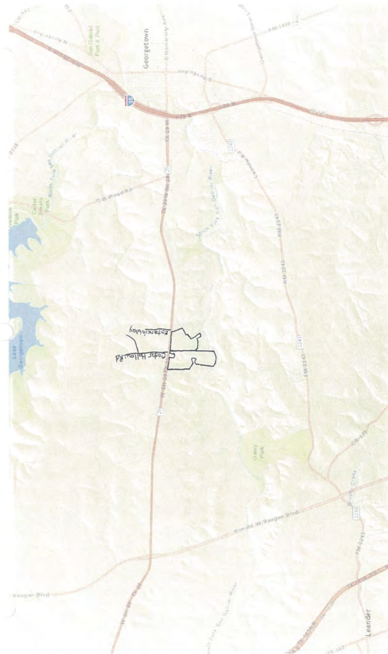
LOCATION MAP - WILLIAMSON COUNTY MUD NO. 30