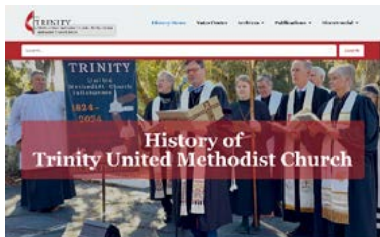
Home page of tumcthistory.org