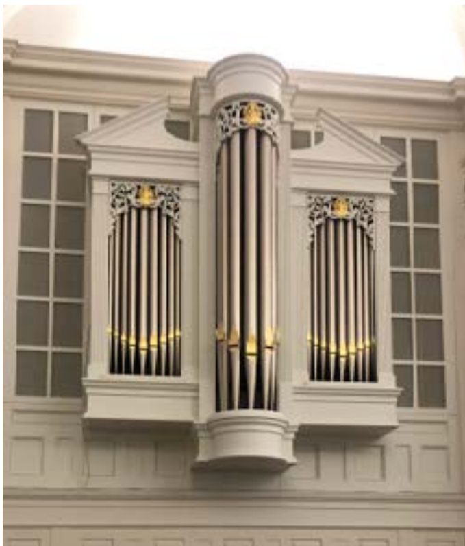
This image clearly shows the "golden throats" on the pipes of Trinity's sanctuary organ.