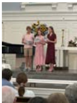
Youth Ensemble performs at the 11:00 service