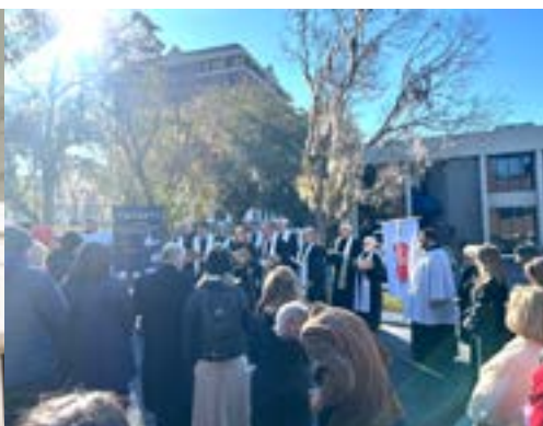
Clergy and worshippers at the site of Trinity's first church building