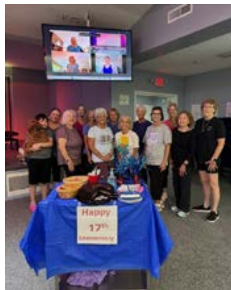
BFC participants celebrate this ministry's 17th anniversary on September 2, 2025

And to anyone who thinks they might like to become fit along with us, we are always open to new members! Find more information, schedules, and forms on the Adult Ministries page of our website.