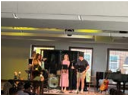
Youth Band performs at the 9:45 service