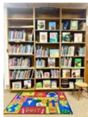
The Caroline Hart Memorial Children's Library at Trinity