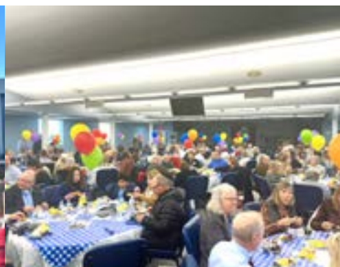
Congregants dining together in Moor Hall after the service