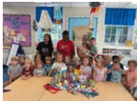
Donations for our Pet Supply Drive