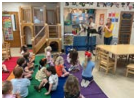
Musicians performing for our VPK students and teaching about their instruments.

During October, we will be closed on October 2 for a Fall Holiday and on October 13 for a Teacher Planning Day. As the month comes to an end, we're looking forward to our annual costume parade on October 31!