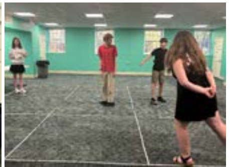
Fellowship in Youth Sunday School