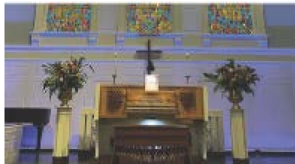
Trinity's Casavant organ