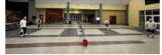
BFC Pickleball participants at FSU Wesley

But—best of all, thanks to the generous and faithful contributions of our attendees—BFC Ministry was able to provide 40 waterproof mattress pads for the Sleep in Heavenly Peace bunk bed build; partial scholarships for 14 FSU students' mission trip to Guatemala; 55 new jackets, 145 pairs of gloves, numerous hats, and countless pairs of socks for our unhoused neighbors; fresh bananas each week to go with Snack Packs; $1,000 to help with the Guadalupe River Flood; $1,500 to Head Start when federal funding was cut, and as part of BFC Ministry's Give Back to Trinity, two Blue Air filtration systems for use in Moor Hall; a fabric steamer for culinary services; and a new storage rack for Snack Pack Ministry organization.