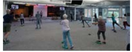
BFC Exercise participants in Moor Hall

Reflecting on 2025, we can say BFC has had a great year! Regular attendees welcomed several new participants, which increased our overall attendance levels. A few of those new attendees also joined Trinity, becoming official members of our church! Our Pickleball team continued to grow and play weekly at FSU Wesley. The BFC Ministry Leadership Team expanded to include new members too. Various celebrations were held throughout the year. And our exercise classes were physically flipped from one end of Moor Hall to the other, improving our tech abilities and Zoom presence.