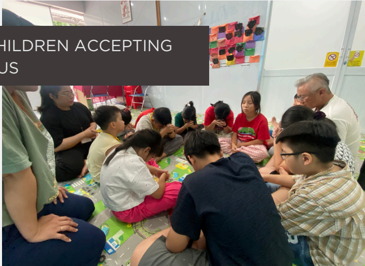
11 CHILDREN ACCEPTING JESUS

The COS Anaheim team traveled to Paul Church, located about 45 minutes outside of Ho Chi Minh City, to serve through a Vacation Bible School (VBS) program. The team developed the entire four-day curriculum from scratch, covering the themes of Creation, Sin, Salvation, and Hope. Along with the lessons, they also created original crafts, discussion questions, and skits to engage the children in a meaningful and interactive way. It was a collaborative effort that allowed the team to creatively and prayerfully share the gospel with the next generation.