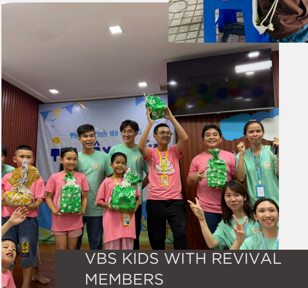
VBS KIDS WITH REVIVAL MEMBERS

What type of STM did the team do? VBS program with 55 kids. The kids learned about trusting in Jesus when they wonder, feel alone, helpless, and powerless through Bible stories. We got to experience the love of Christ for these kids through worship, crafts, and game times.