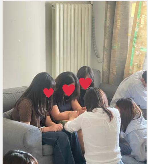
Praise God! During Alpha, a seeker accepting Christ

This year, we have 12 graduates. Please pray for our brothers and sisters as they transition into the workplace or wider society. May they trust in the Lord and experience His guidance and blessings in every step they take.