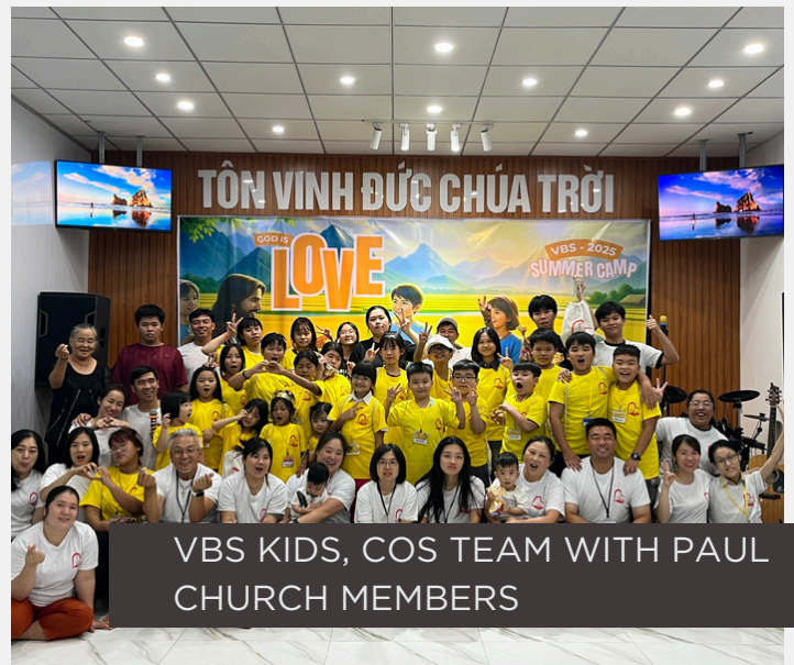
VBS KIDS, COS TEAM WITH PAUL CHURCH MEMBERS

What were some of the team member's favorite memory?