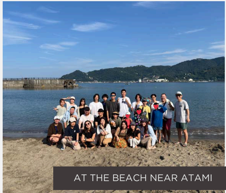
AT THE BEACH NEAR ATAMI