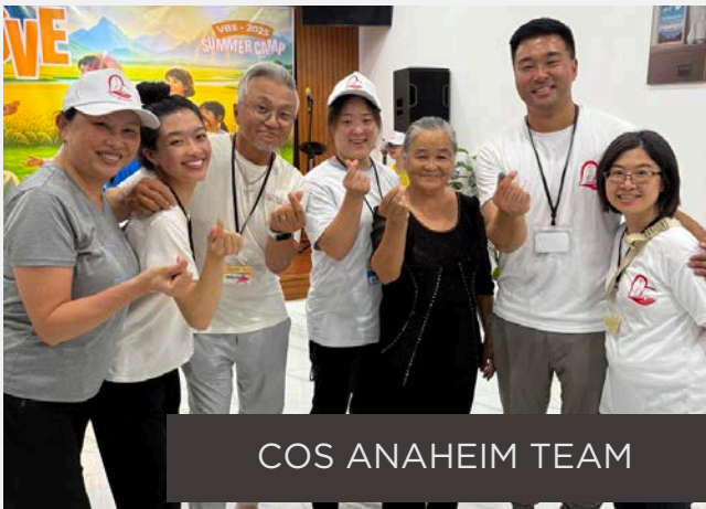
COS ANAHEIM TEAM

The COS Anaheim team traveled to Paul Church, located about 45 minutes outside of Ho Chi Minh City, to serve through a Vacation Bible School (VBS) program. The team developed the entire four-day curriculum from scratch, covering the themes of Creation, Sin, Salvation, and Hope. Along with the lessons, they also created original crafts, discussion questions, and skits to engage the children in a meaningful and interactive way. It was a collaborative effort that allowed the team to creatively and prayerfully share the gospel with the next generation.