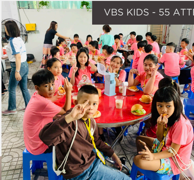
VBS KIDS - 55 ATTENDED

What type of STM did the team do? VBS program with 55 kids. The kids learned about trusting in Jesus when they wonder, feel alone, helpless, and powerless through Bible stories. We got to experience the love of Christ for these kids through worship, crafts, and game times.