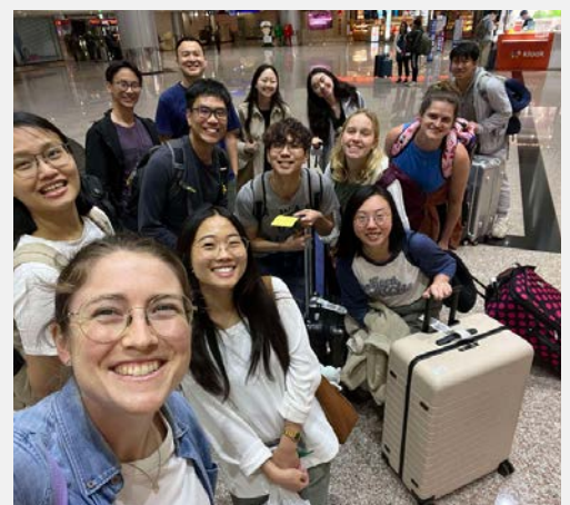
AMI STM Team from Renewal & Journey Church of Atlanta