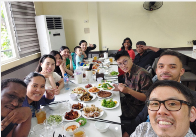
Post Experiencing God Discipleship Course lunch & fellowship