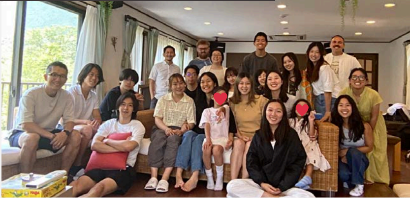
GROUP PHOTO AT THE RETREAT