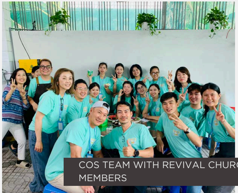
COS TEAM WITH REVIVAL CHURCH MEMBERS

In what ways did the team witness God moving? When complete strangers who have never met and do not even share a common language come together in unity - sharing, serving, and moving as one in the heart and mind of Christ, this kind of love can only be made possible through the grace and power of the Holy Spirit at work among us.