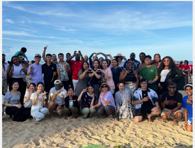
Summer Church Beach Outing - July 2025