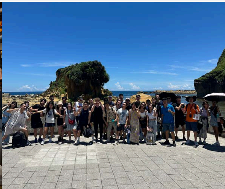
Pictured at the Holy Spirit Weekend, 36 people attended, 11 new seekers