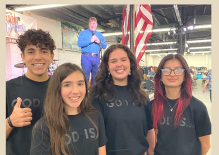
House of Faith students sang the National Anthem at the Cowboy Gathering