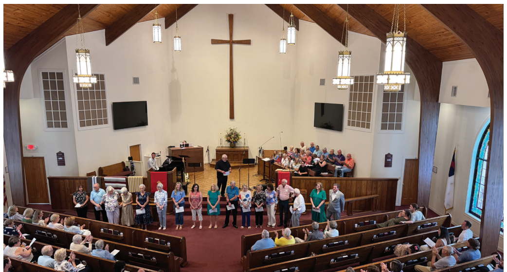
Sunday Service • June 29, 2025 • Our One-Year Anniversary • Welcoming 17 new PMC members!

As we move into our second year as a GMC, I pray that our pauses for praise will not "glue us to our seats." The Spirit is still moving, and it is vital that we keep up! My desires for our Pendleton Methodist Church are that our discipleship will be even deeper, our mission will be even wider, and our worship will be even more vibrant. The Spirit of God will beckon us, He will push us, and He will accompany us – as long as our goal remains Jesus Christ.