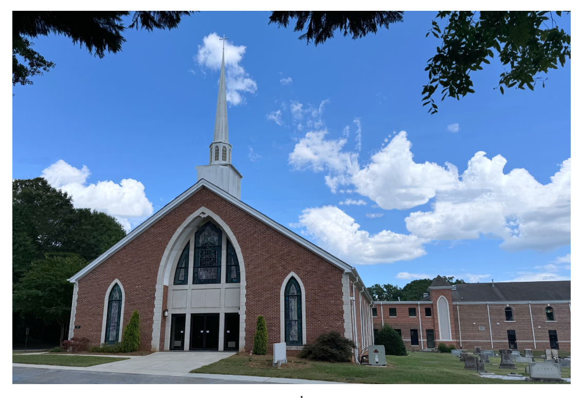
February 23, 2025