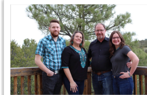
The "B" Family in Europe & South Asia