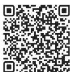
School Supply Wish List