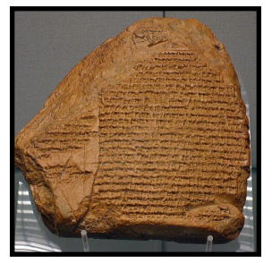
The Nabonidus Chronicle, mentioning King Belshazzar's reign

But don't forget that the liberal scholars said the same thing about (ch. 5)—until archeology uncovered his name.