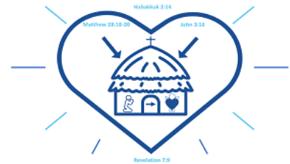
Figure 1 The Father's Heart is for His glory

Last Proclaimer, we introduced you to what our organization, the IMB, calls the Missionary Task (M-task) and what we believe the Bible calls ALL Christians to be a part of. Last article, we focused on the reality in Scripture that The Father's Heart is for His glory . This article's focus is on the way the Father spreads his glory across the world through bringing people to Himself.