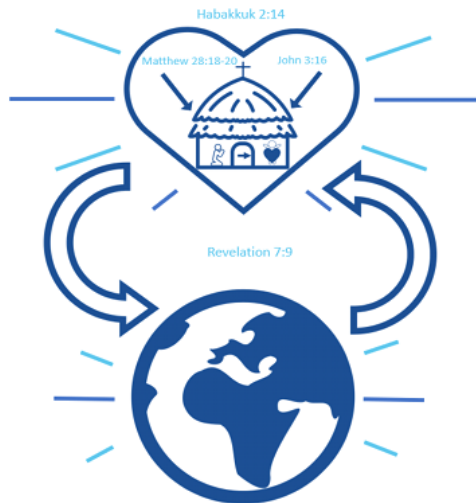
Figure 2 The Father spreads His glory by bringing people to Himself

Since God loves the whole world (John 3:16), he desires to save the lost and he has given his church the great commission (Matt 28:18-20) for the purpose of bring the world to Christ. God spreads his glory across the world through the local church (symbolized by an African looking church building in the middle). The plan of God to bring the world to himself is through local churches who are planting other churches. God does work through individuals , but those individuals should always be connected to, and a part of a local church. Sometimes those churches plant other churches in their own "Jerusalem" and "Judea" and sometimes those churches send "sent out ones" (missionaries) to go and plant other churches that will plant more churches in "Samaria" and the "ends of the earth." Do you see that these individuals have certain characteristics? You can see that they are people who pray (symbolized by the person on their knees), they are people who abide in Christ (symbolized by the person with a big heart), and they are people who go to their neighbors with the gospel (symbolized by the arrow at the door). Those church members are on mission in their day to day lives bringing people to Christ, and they are focused on planting more churches.