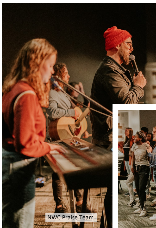
NWC Praise Team