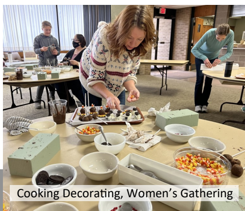
Cooking Decorating, Women's Gathering