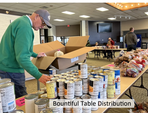
Bountiful Table Distribution