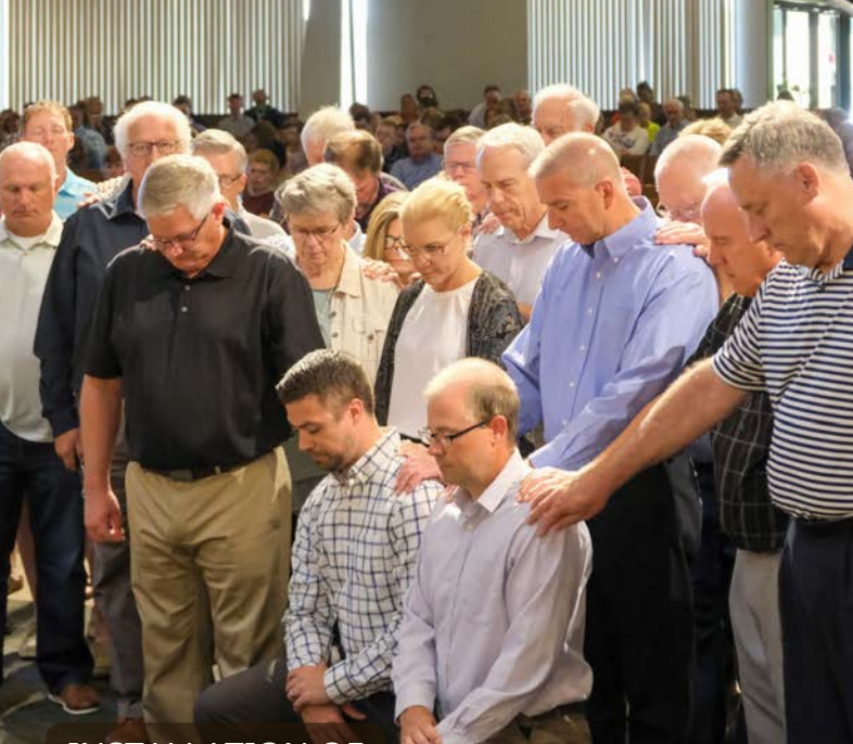
INSTALLATION OF ELDERS & DECONS