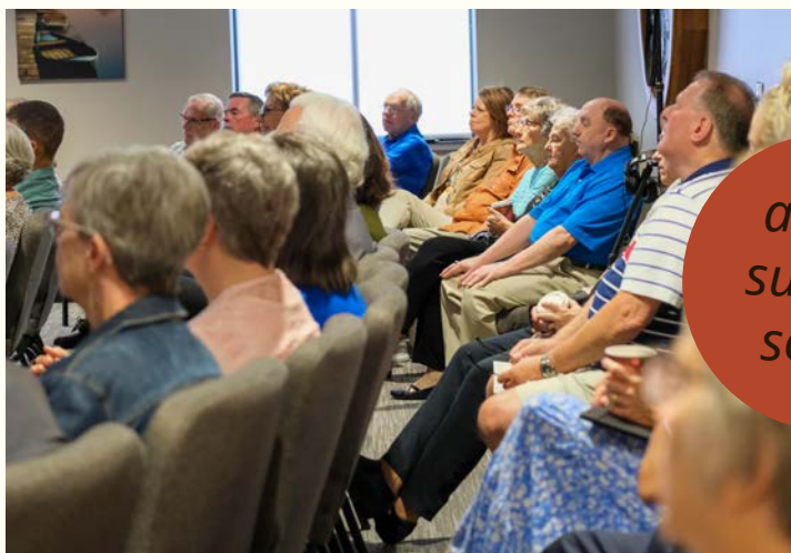
adult sunday school