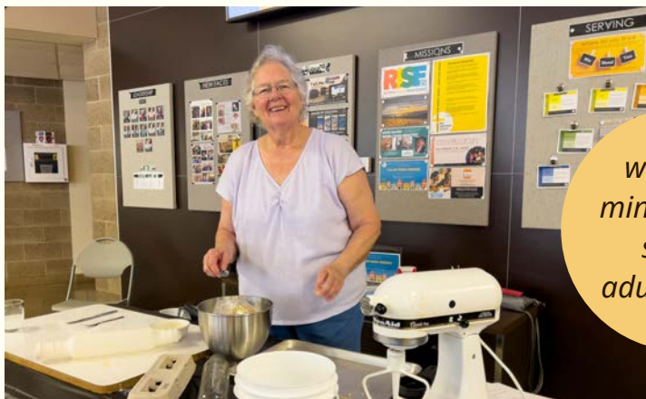
women's ministry (left) senior adults (right)