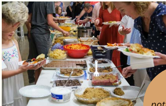
meals potluck & NWC athletic feed