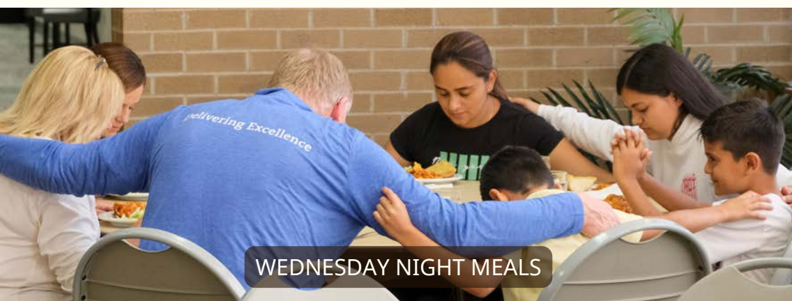
WEDNESDAY NIGHT MEALS