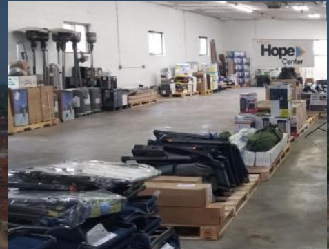
THE HOPE CENTER WAREHOUSE SIOUX CITY, IOWA