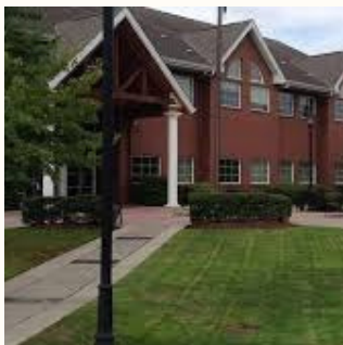
SUMNER-BONNEY LAKE SCHOOL DISTRICT

School districts provide the local management and oversight to public K-12 education. They serve as the local delivery system for education. The district superintendent, staff and school board manage policies, finances, curriculum, and operations for the entire district. The elected school board represents community needs, and ensures accountability for student achievement and state standards.