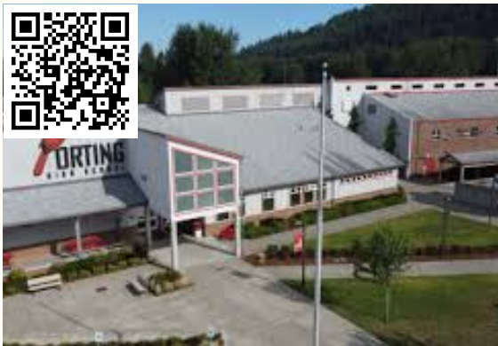
ORTING HIGH SCHOOL