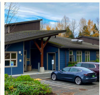
DIERINGER HEIGHTS SCHOOL DISTRICT