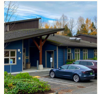
DIERINGER HEIGHTS SCHOOL DISTRICT

The main challenge facing the Orting School District is significant and rapid enrollment growth, leading to overcrowding in elementary and high school facilities, insufficient classroom and cafeteria space, and the use of portable classrooms. The district is struggling to accommodate a high influx of new families, even as other districts in Washington experience declining enrollment. This overcrowding impacts student learning by limiting access to resources, increasing travel time between buildings, and making it difficult for teachers to provide one-on-one attention.