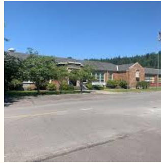
ORTING SCHOOL DISTRICT

The White River School District faces challenges including the financial reliance on voter-approved levies to supplement state funding, managing student engagement and support through its Re-Engagement Center, and ensuring school safety, particularly concerning issues like harassment, bullying, and potential drug problems at the middle school level. Recent infrastructure issues, such as a bridge closure impacting transportation, have also presented operational hurdles.