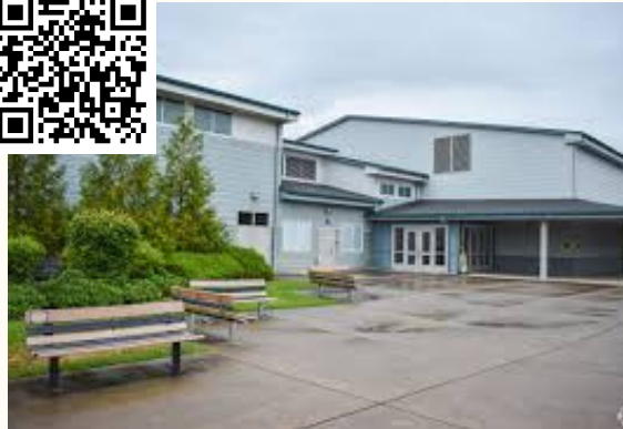
NORTH TAPPS MIDDLE SCHOOL