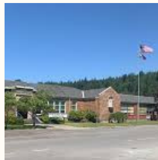
ORTING SCHOOL DISTRICT