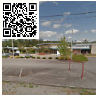
EARLY LEARNING CENTER