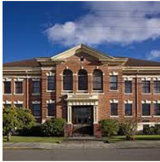
WHITE RIVER SCHOOL DISTRICT

The main challenges facing the Sumner-Bonney Lake School District are student overcrowding and the need to upgrade aging facilities, driven by rapid population growth. The district has seen significant increases in student enrollment and has numerous schools over 100% capacity, necessitating new classrooms and facility replacements to ensure educational opportunities and student safety. These challenges require funding through voter-approved bonds to address the expanding capacity and outdated infrastructure.