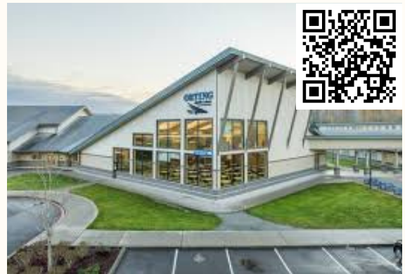
ORTING MIDDLE SCHOOL