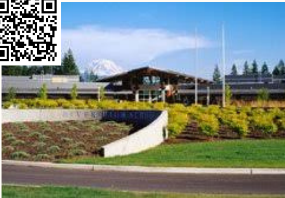
WHITE RIVER HIGH SCHOOL