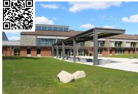
GLACIER MIDDLE SCHOOL