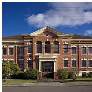
WHITE RIVER SCHOOL DISTRICT