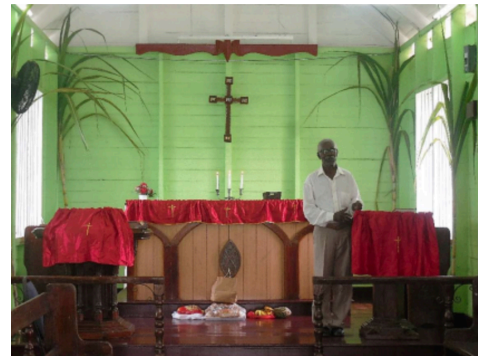
One of our companion churches in Guyana, which is a major Hope Lutheran Church focus for its Lay Leadership Program