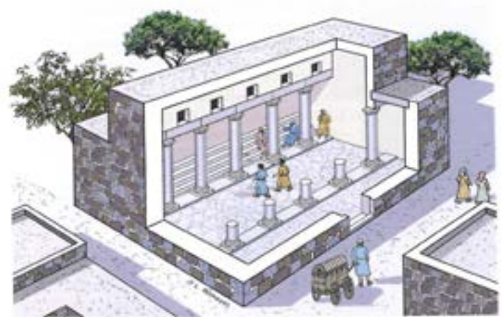
Reconstruction of the First Century Synagogue in Capernaum

Ask the Holy Spirit to show you a place or someone to share the Gospel where you risk being rejected. Share with your small group what happened and any doors the Lord might have opened.