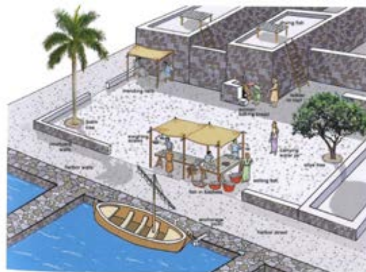
Capernaum Waterfront of Simon and Andrew's Home

Invite someone into your home for a meal and fellowship who you would not normally invite. They may be someone who isn't Christian or perhaps someone in need. They might be hurting or ailing in some way. Serve them as you believe Jesus would. Seek opportunities to build a relationship with them and allow them to serve you as Simon's mother-in-law served.