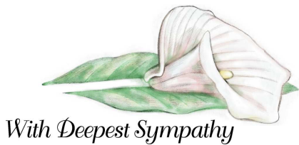
With Deepest Sympathy