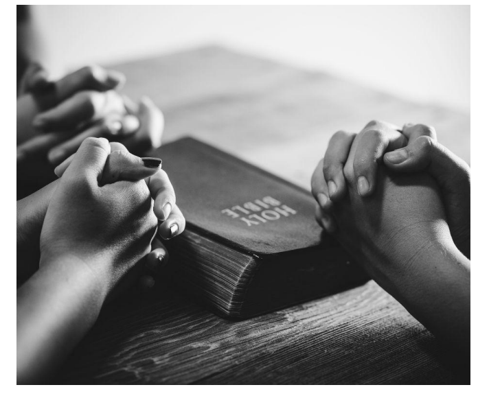
Boat Sinking Blessings!

Sign-up sheets are in the Narthex and Fellowship Hall.