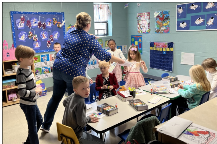
A peek inside Sunday morning Children's Ministry

Kids - look for the hidden orange somewhere in this issue of the newsletter!