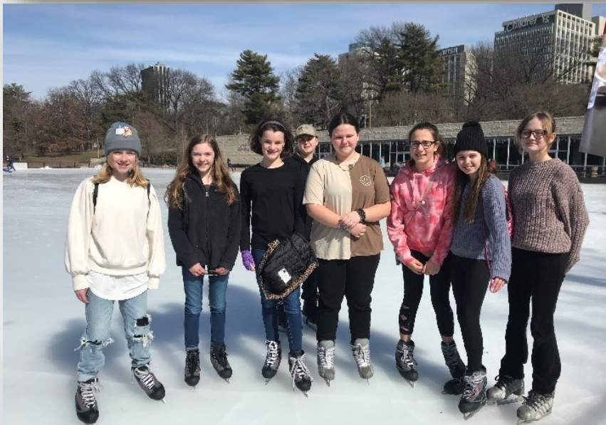
Middle School Special Event – lunch at Fitz's Bottling Company & Ice Skating in Forest Park