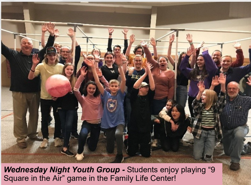
Wednesday Night Youth Group - Students enjoy playing "9 Square in the Air" game in the Family Life Center!

* 1/2 of camp fees will be paid by the church through the Youth Scholarship Fund