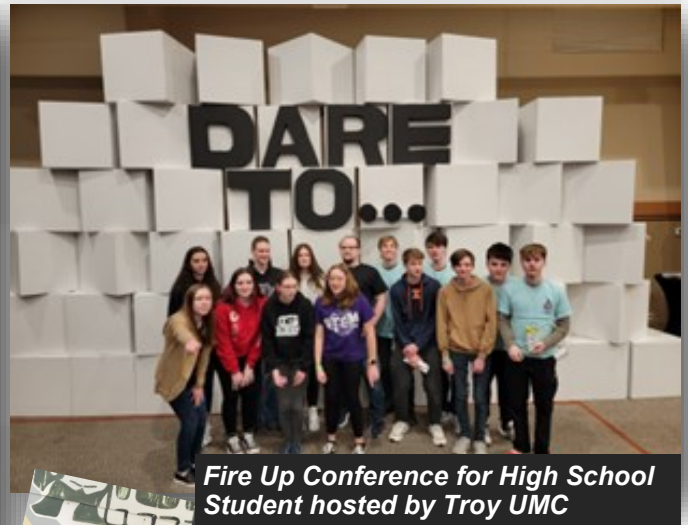
Fire Up Conference for High School Student hosted by Troy UMC