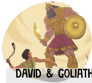
DAVID & GOLIATH